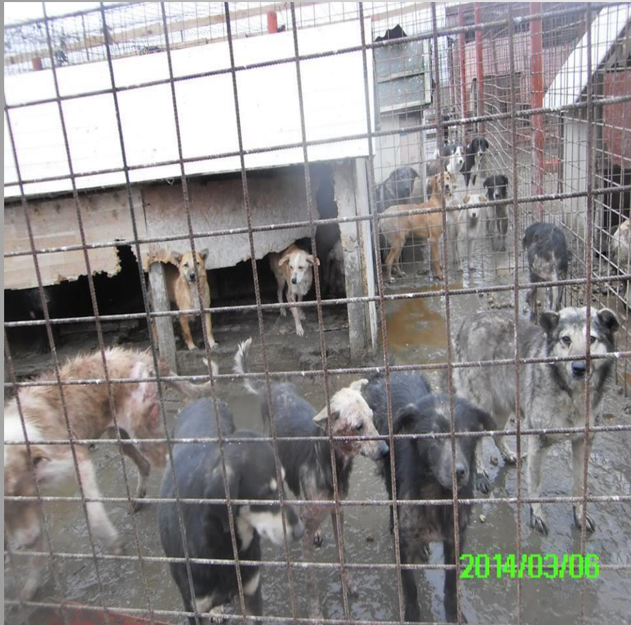
Bacau (March 2014)