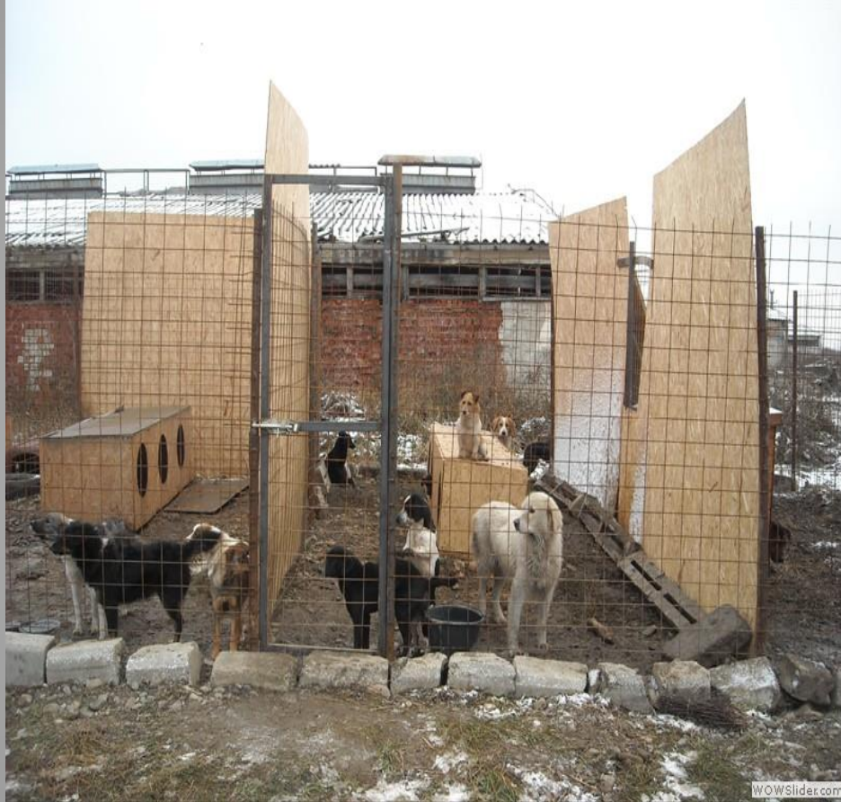
Radauti (December 2013)