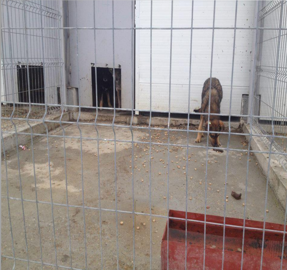
Craiova (February 2014)